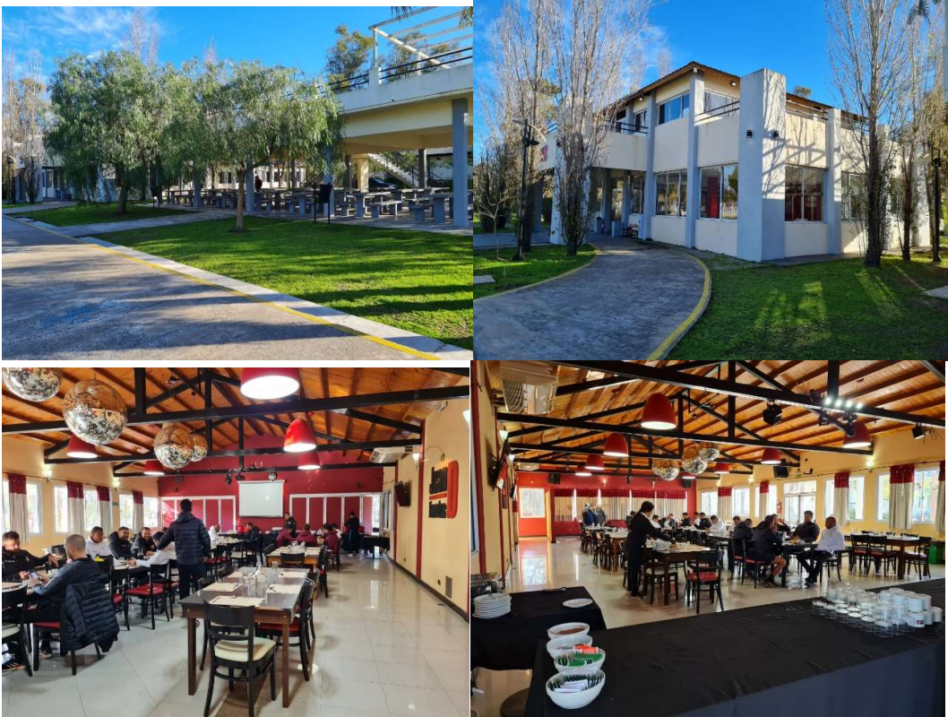
Salón de competencia ( debajo del hotel)